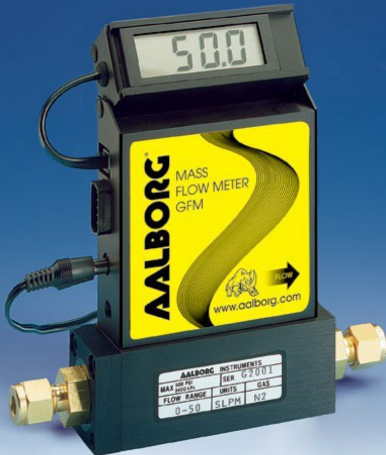
Typical Aluminum GFM Mass Flow Meter